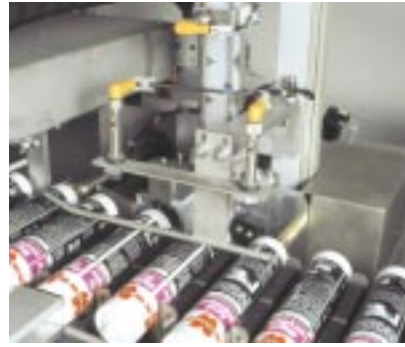
Prisma Chain, Filling and Plunger Insertion